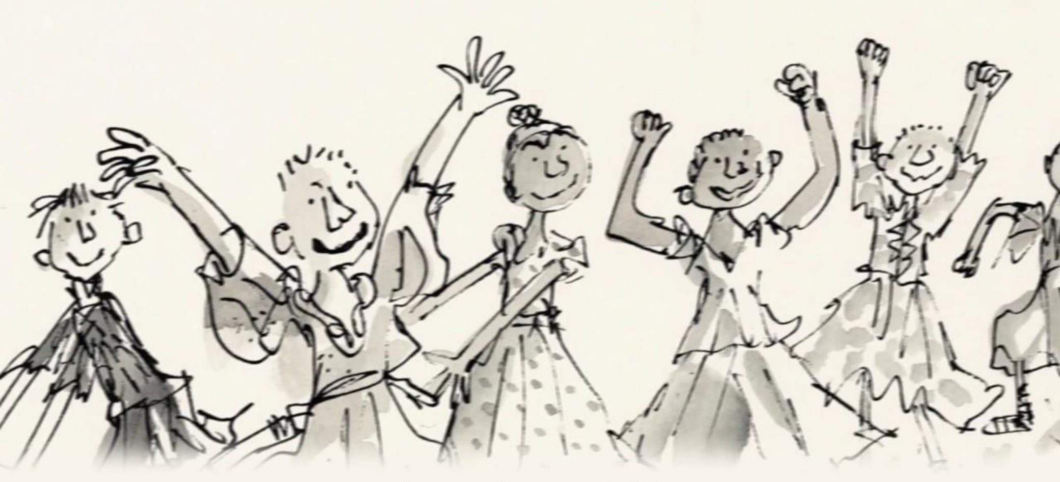
they are running out onto the field