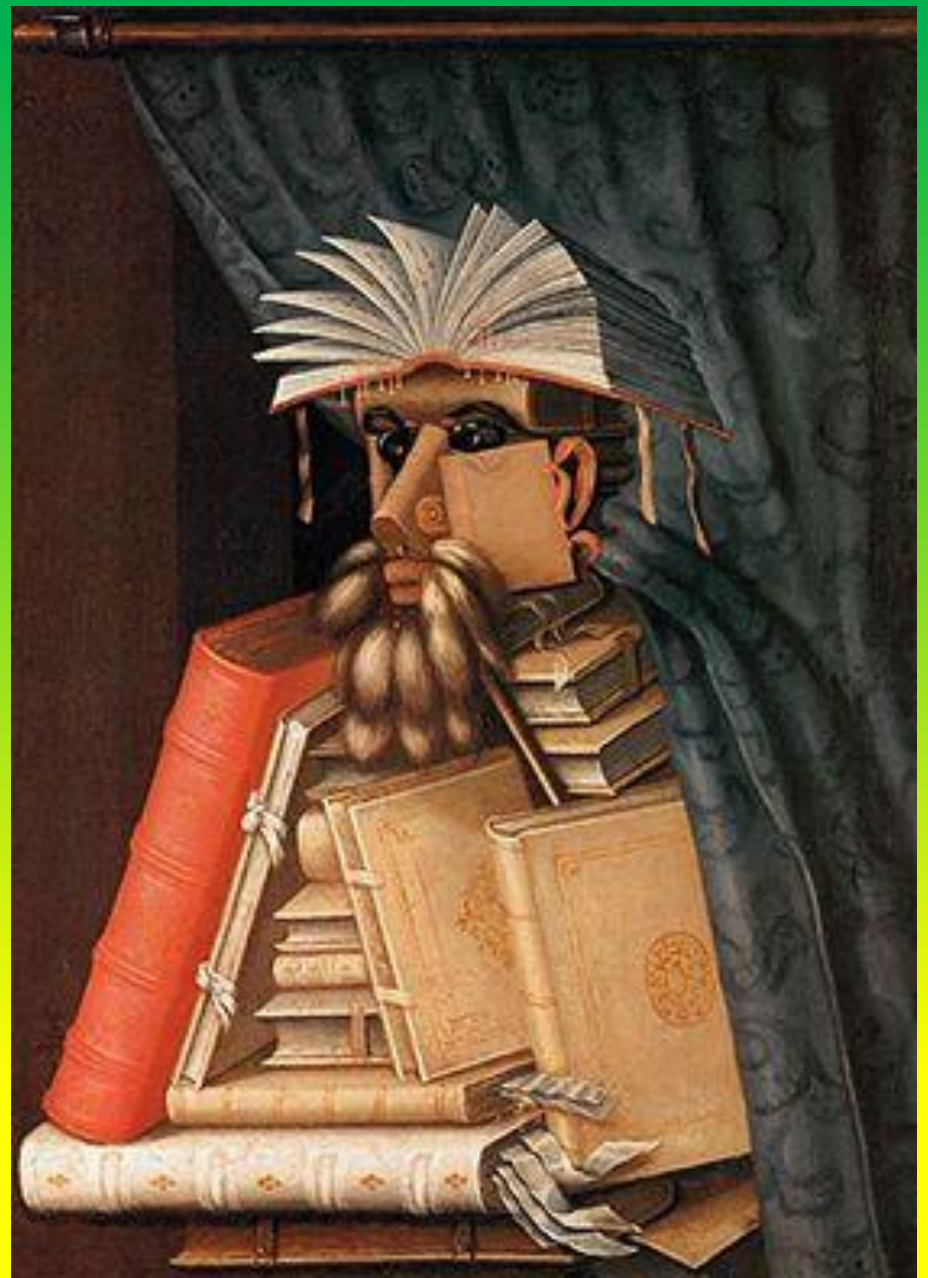
The Librarian - Arcimboldo