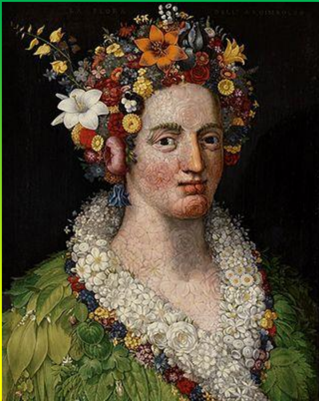
Flora - Arcimboldo