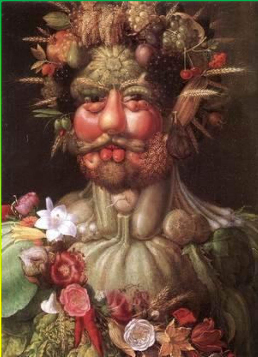
Vortumnus - Arcimboldo