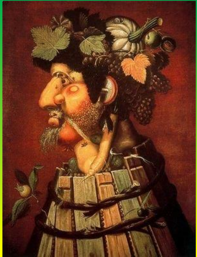
Art Challenge Number 12 Arcimboldo Making Faces